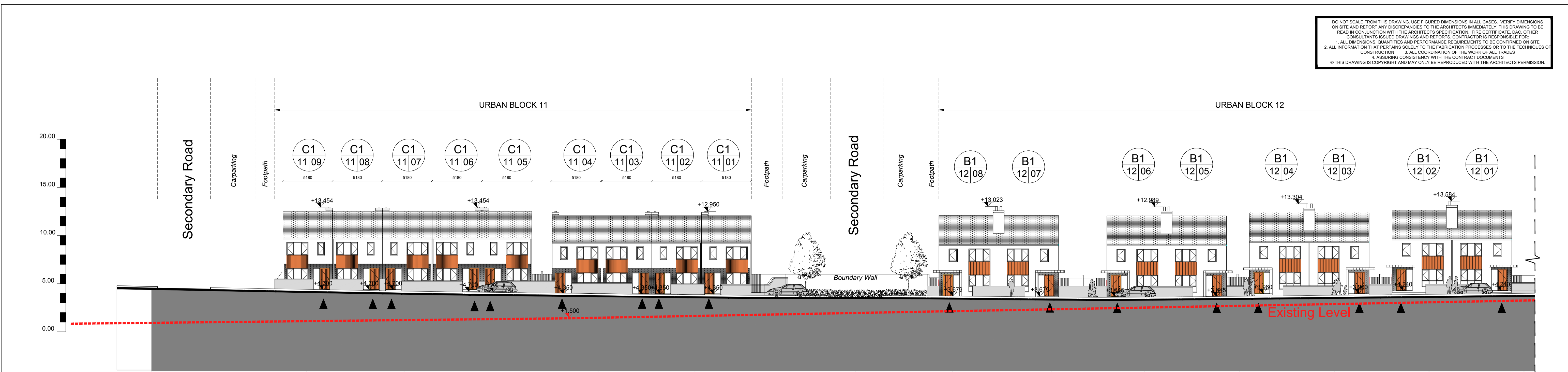
Site Section C-C 1:200

DO NOT SCALE FROM THIS DRAWING. USE FIGURED DIMENSIONS IN ALL CASES. VERIFY DIMENSIONS ON SITE AND REPORT ANY DISCREPANCIES TO THE ARCHITECTS IMMEDIATELY. THIS DRAWING TO BE READ IN CONJUNCTION WITH THE ARCHITECTS SPECIFICATION, FIRE CERTIFICATE, DAC, OTHER CONSULTANTS ISSUED DRAWINGS AND REPORTS. CONTRACTOR IS RESPONSIBLE FOR: 1. ALL DIMENSIONS, QUANTITIES AND PERFORMANCE REQUIREMENTS TO BE CONFIRMED ON SITE 2. ALL INFORMATION THAT PERTAINS SOLELY TO THE FABRICATION PROCESSES OR TO THE TECHNIQUES OF CONSTRUCTION 3. ALL COORDINATION OF THE WORK OF ALL TRADES 4. ASSURING CONSISTENCY WITH THE CONTRACT DOCUMENTS © THIS DRAWING IS COPYRIGHT AND MAY ONLY BE REPRODUCED WITH THE ARCHITECTS PERMISSION.